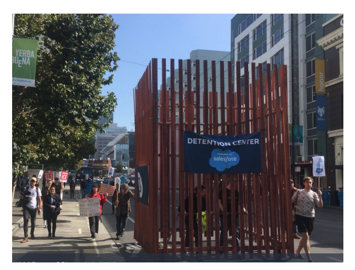
Image 2: Tech Worker Protest Against Salesforce's Contract with CBP, August 2018 in San Francisco